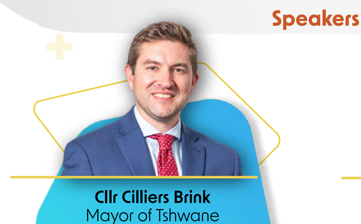
Republic of SA

Take up your torch and join us at the CSIR International Convention Centre, Pretoria for our annual Lighting the Future Conference for nurses and midwives where we will work together towards a better tomorrow for our patients and students.