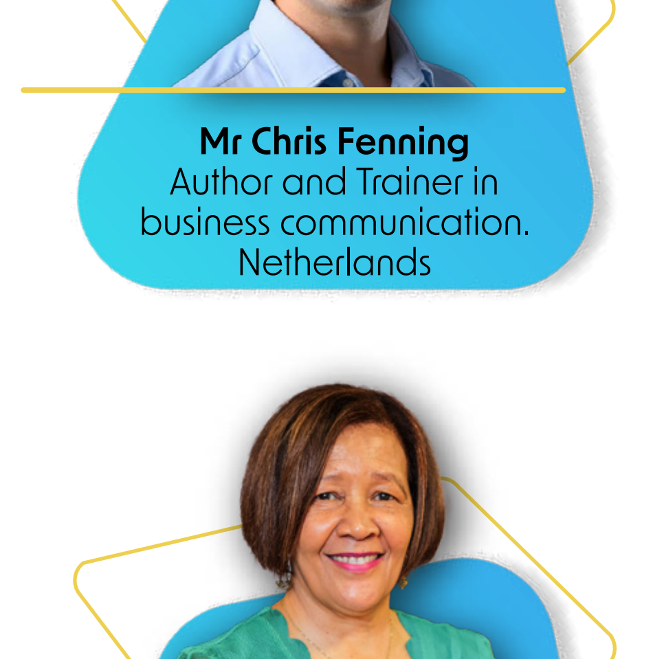
More coming soon!