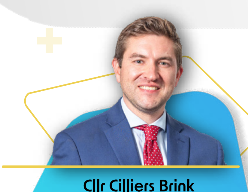
Republic of SA